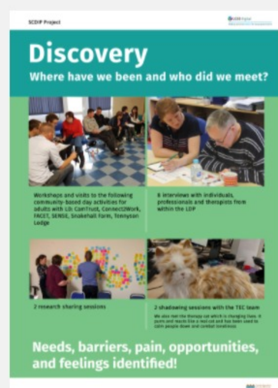
Where have we been and who have we met?