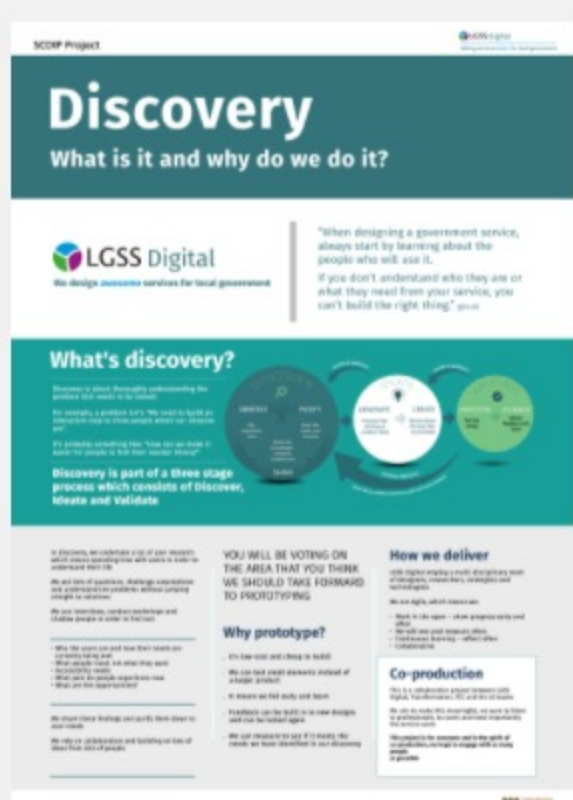
What is discovery?

There are going to be lots of events taking place all over the country next week that you can get involved in by attending the events in person or remotely. We will also be running the following events locally, so please do come along if you are interested!